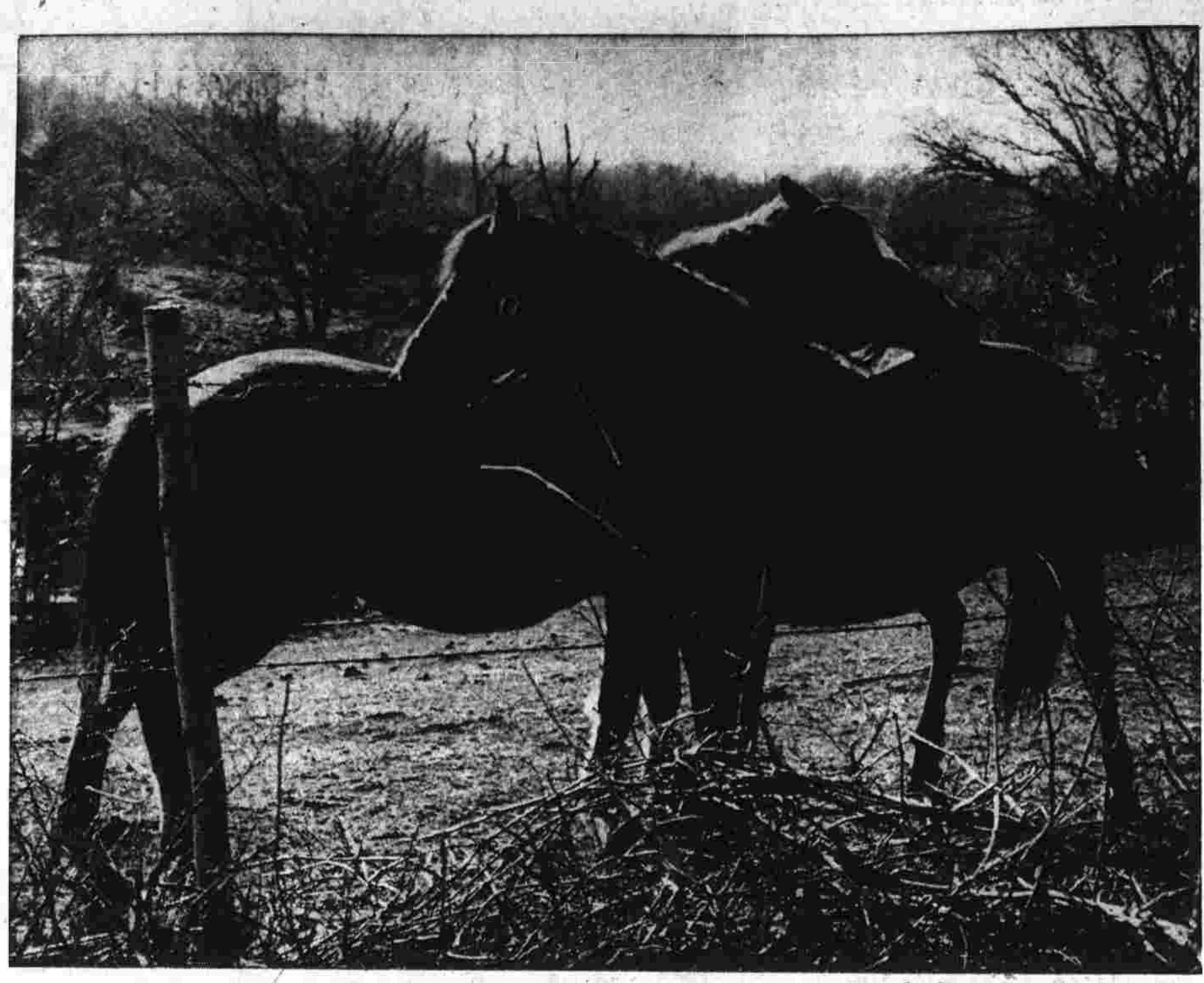
On Country Roads With Rhythmic Ours. FIRST DAY OUT TO PASTURE: "You Scratch My Back And I'll Curry Yours"

Refuse Unit Meets Today The Northeast Refuse Committee (NREC) of the five towns associations which wants to establish a joint refuse incinerator facility for its member communities will meet at tonight in the Municipal Building hearing room.