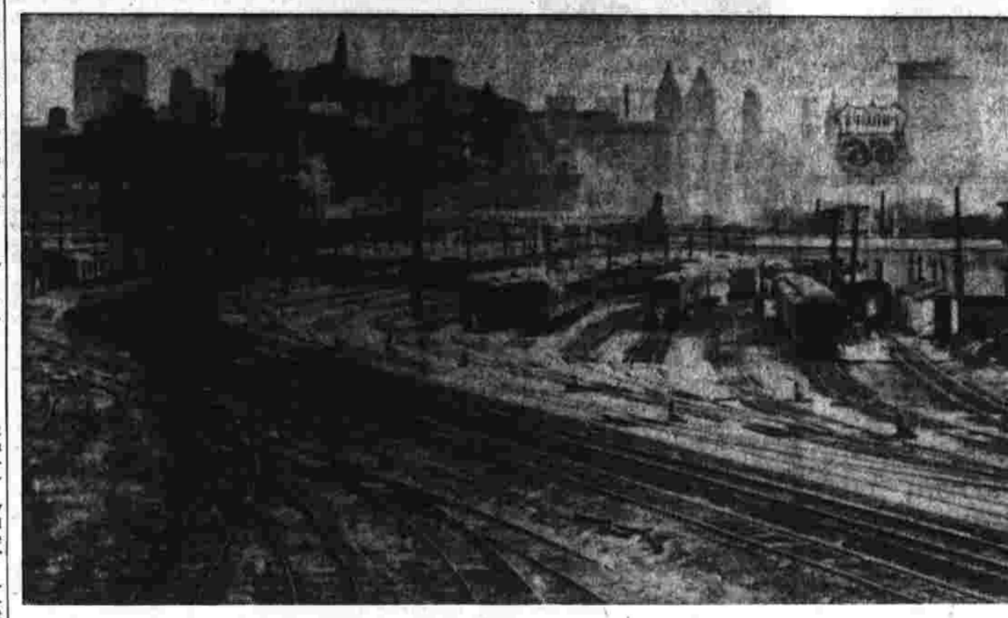
Idle passenger cars stand in strikebound Illinois Central Railroad yards in Chicago.