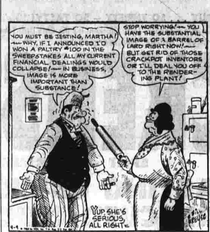
OUR BOARDING HOUSE