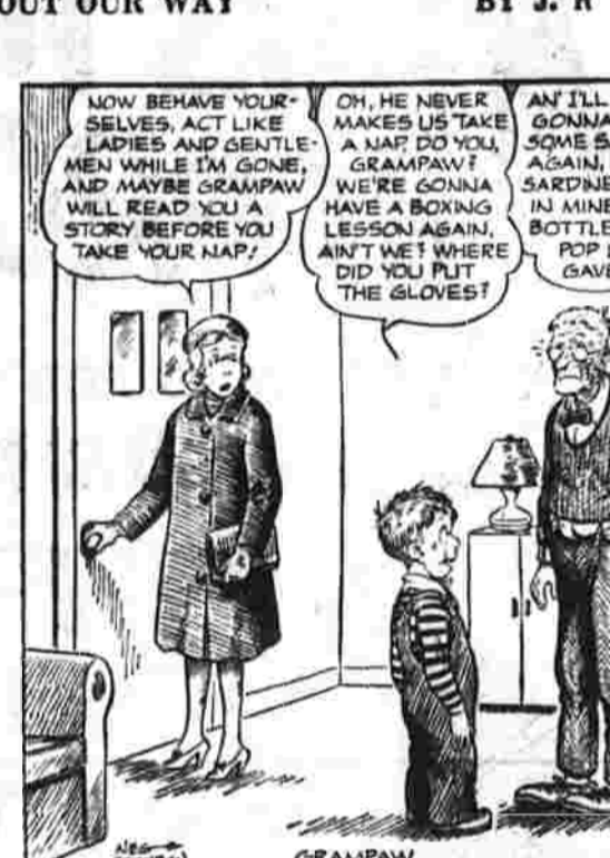
OUT OUR WAY